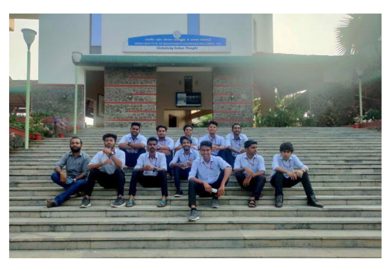
At IIMK LIVE