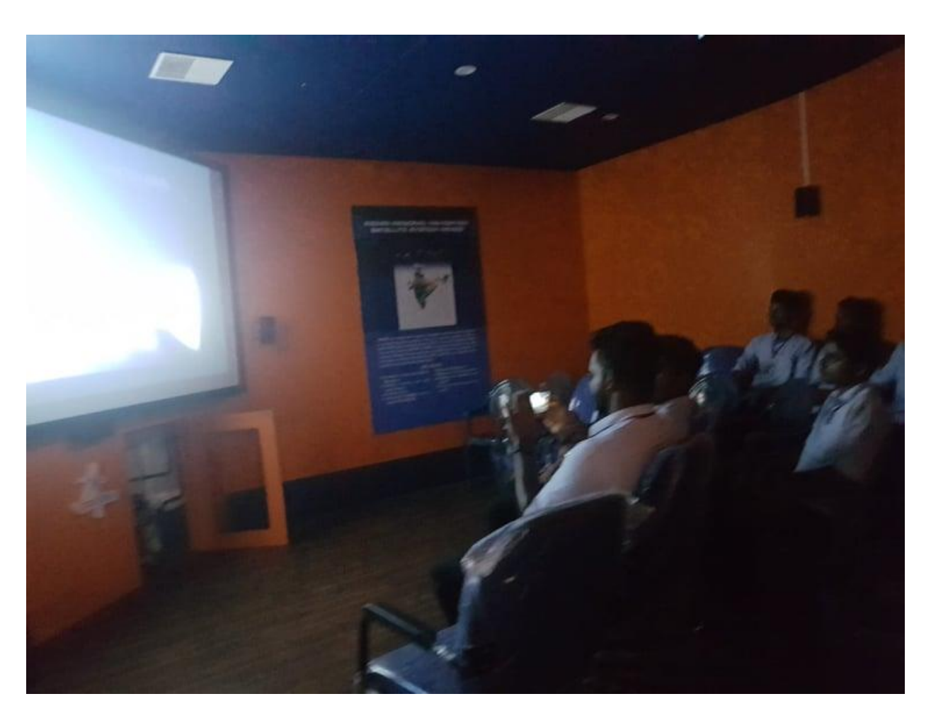
At IIMK Class Room