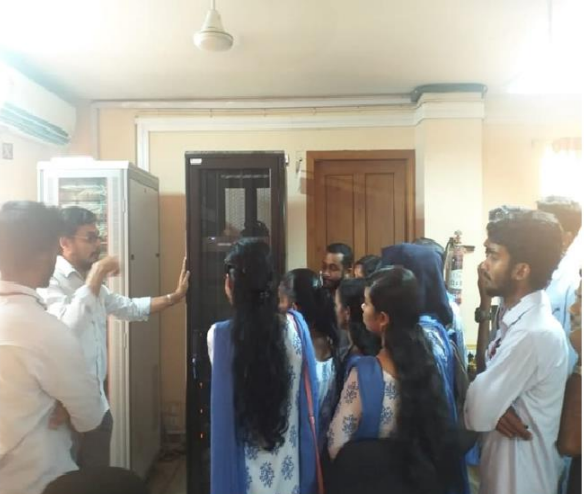
At IIM Kozhikode campus