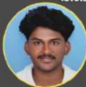
Adarsh A III BCA